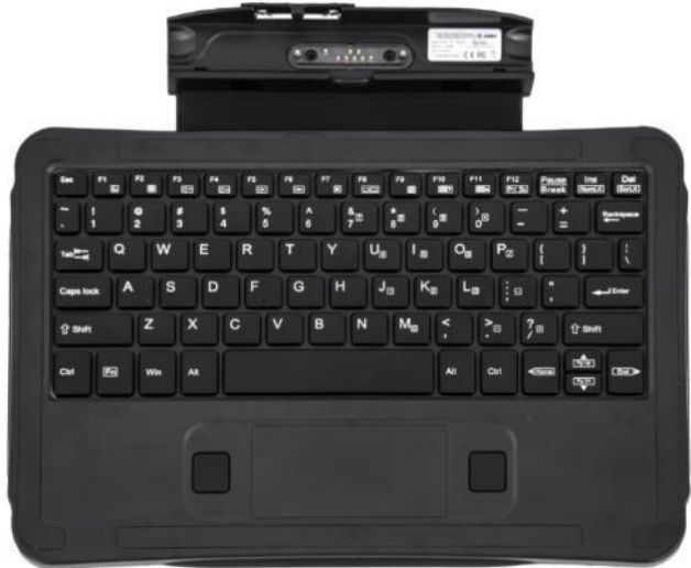
Rugged IP65 keyboard with backlighting

420095 (Rugged Companion Keyboard – US) 420096 (Rugged Companion Keyboard – UK) 420097 (Rugged Companion Keyboard – DE) 420098 (Rugged Companion Keyboard – FR) 420099 (Rugged Companion Keyboard – ES)