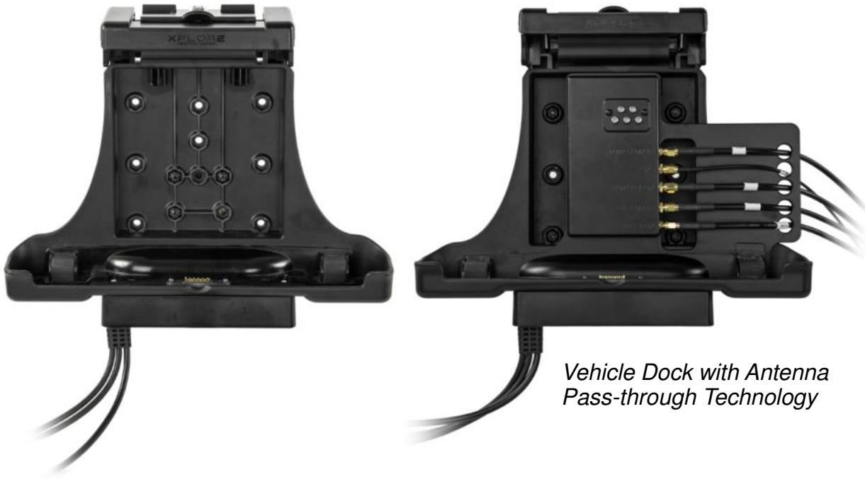
Vehicle Dock with Antenna Pass-through Technology