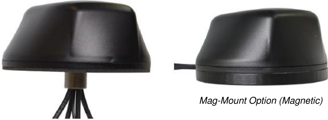
Mag-Mount Option (Magnetic)