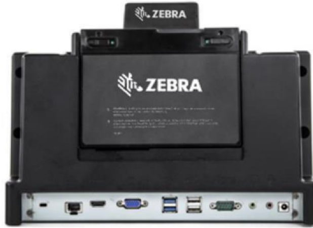
Back view showing optional battery charger (top) and I/O connectivity (bottom)