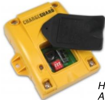
Havis Charge-Guard Auto Shutoff Timer