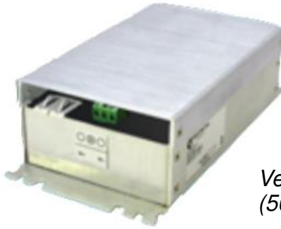
Vehicle Power DC Converter (50-150V or 9-60V)