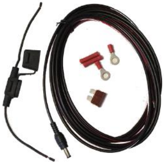
Direct Wire Power Cable Kit