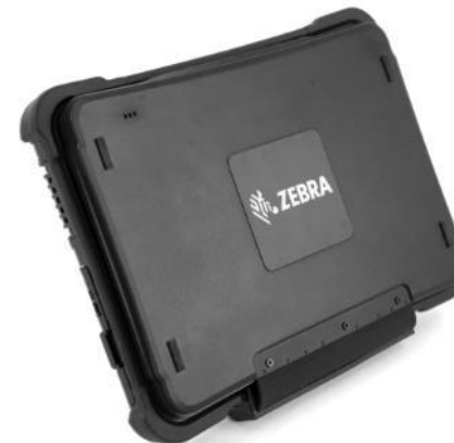
Keyboard in closed position via magnets, protecting display glass