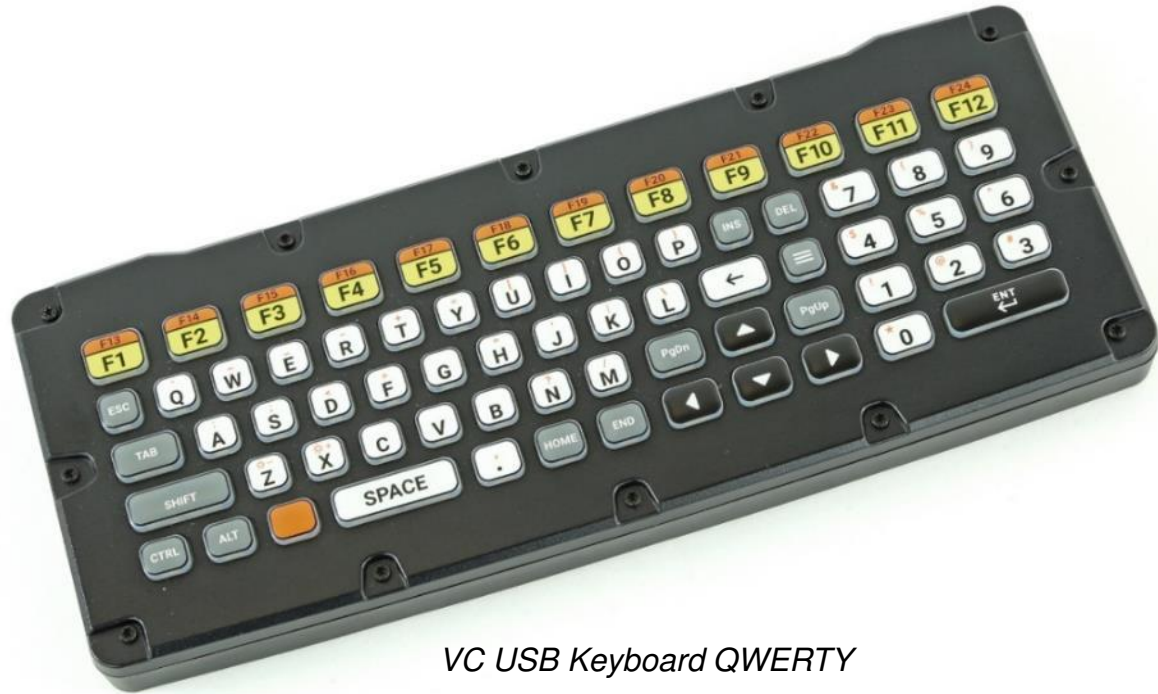
VC USB Keyboard QWERTY