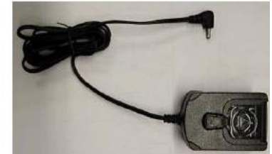
PWR-WUA5V4W0US Power Supply 5.2v, 1.1A