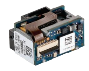
SE4750 Standard Range Array Imager