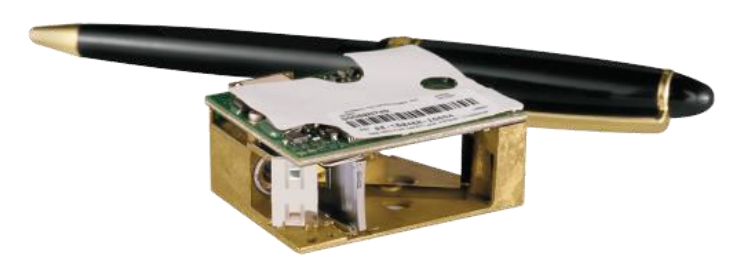
SE965 1D Standard Range Scan Engine

SE4750 1D/2D Standard Range Array Imager