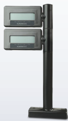
90ACC0343 Dual Display/Single Interval