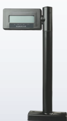
90ACC0340 Single Display/Single Interval