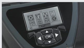
Easy-to-read display with larger, higher-resolution screen