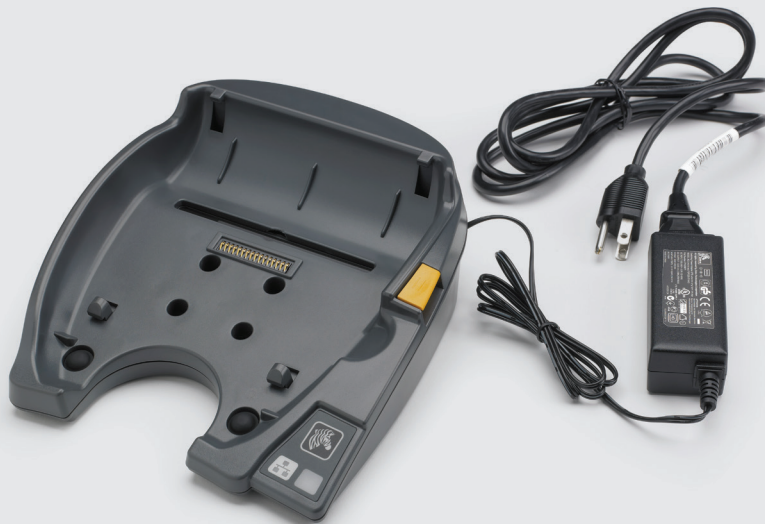
QLn420 charging and Ethernet cradle