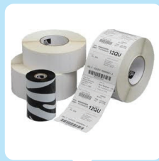
Consumables (labels, ribbons, PVC cards)