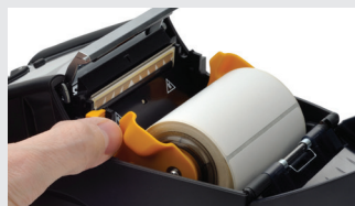
Intuitive peeler operation