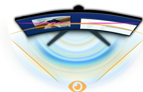
CURVED DESIGN 1500R

VA panel technology offers higher contrast, darker blacks and much better viewing angles than standard TN technology. The screen will look good no matter what angle you look at it.