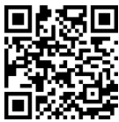
X600 3D demo